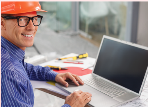
FF&E AND OS&E PROCUREMENT SOLUTIONS