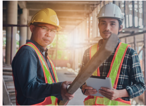
QUALITY CONTROL & QUALITY ASSURANCE