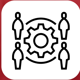
CUSTOMER SERVICE SPECIALIST

We understand the complex challenges faced by today's small and medium sized businesses, so when it comes to outsourcing human resources, we've got you covered. We offer a variety of SERVICES that can help your company manage its people more effectively: