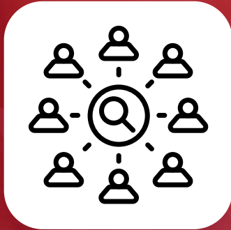
LEAD GENERATION SPECIALIST