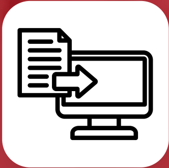
DATA ENTRY SPECIALIST