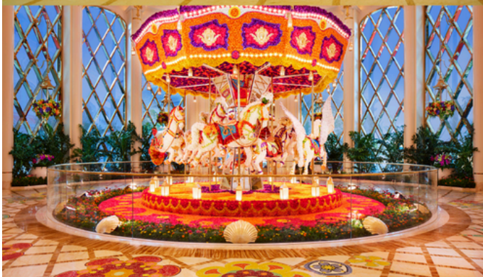
Wynn Palace Macau