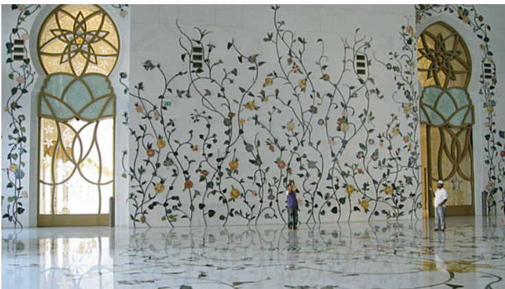
Sheikh Zayed BinSultan Nahyan Mosque, UAE