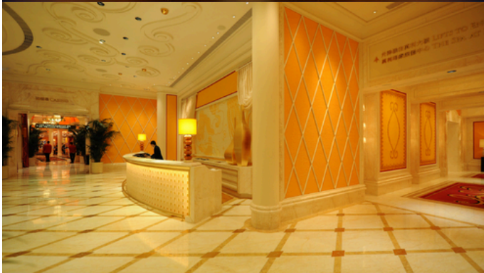
Wynn Palace Macau