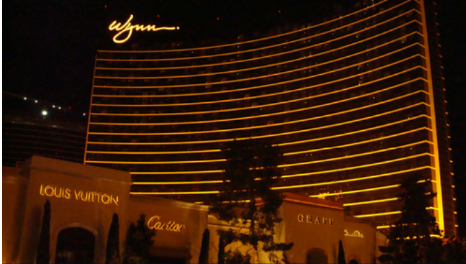
Wynn Las Vegas, United States