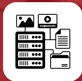
FILE & DATABASE MANAGEMENT