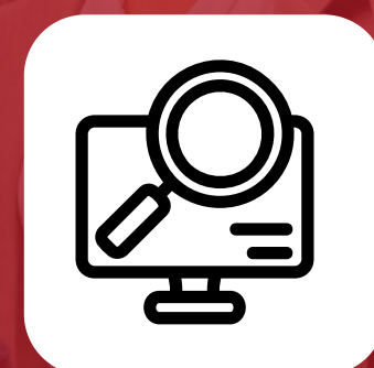
ONLINE RESEARCH & REPORTING