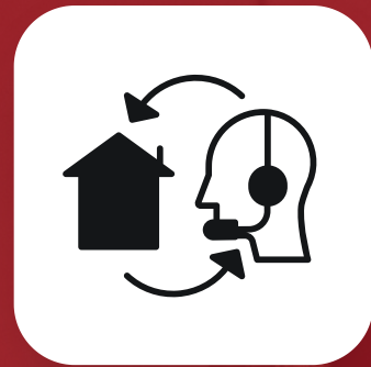
REAL ESTATE VA SUPPORT