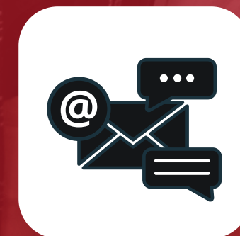
EMAIL & COMMUNICATION MANAGEMENT