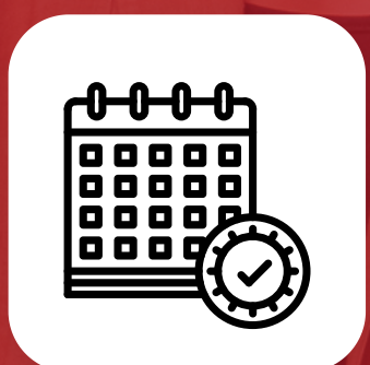
SCHEDULE & EVENTS MANAGEMENT