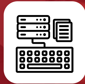
DATA ENTRY & ENCODING