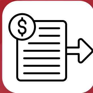
ACCOUNTS PAYABLE AND RECEIVABLE